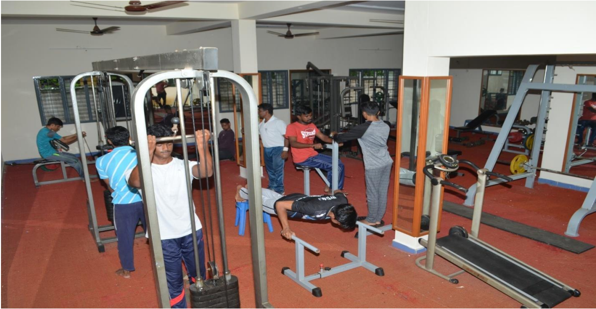
Students are doing Exercise under the Guidance of Gym Instructor